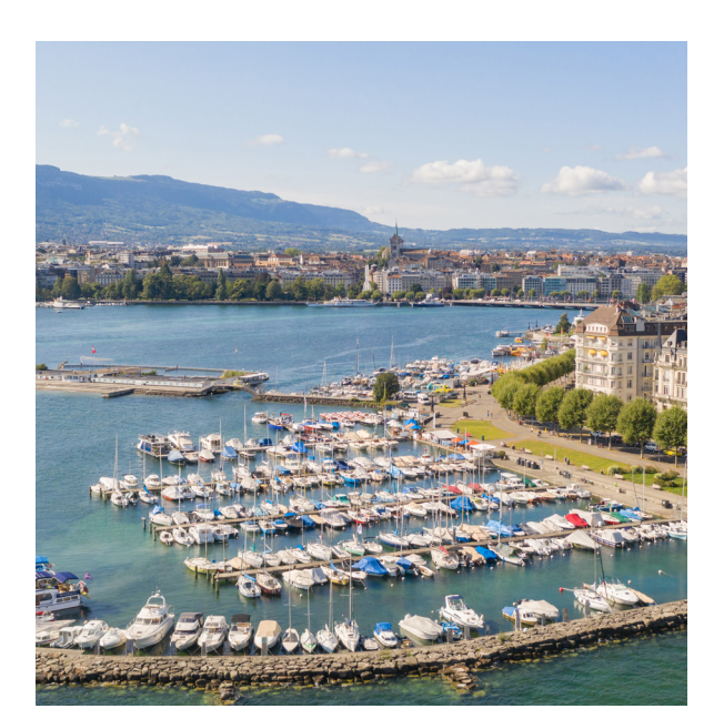
OETKER COLLECTION Masterpiece Hotels